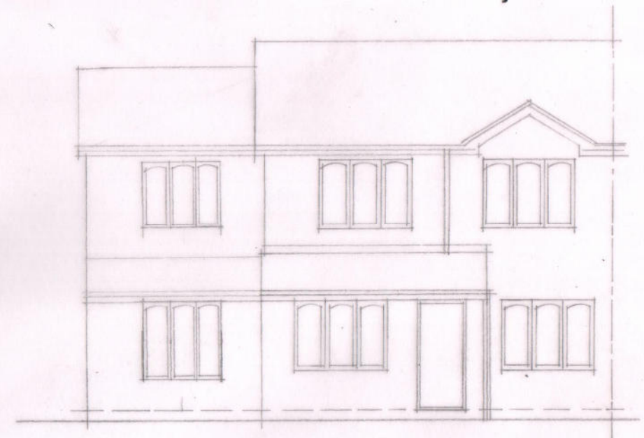
PROPOSED FRONT ELEVATION 1:100 REV B. PROPOSED SIDE ELEVATION AMENDED. REV A. PROPOSED ELEVATIONS AMENDED